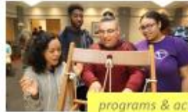
programs & activities