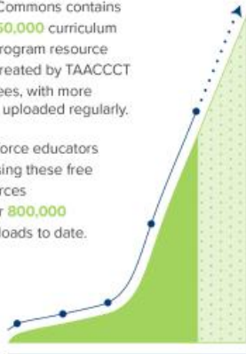
December 2015 - February 2018 Downloads

Workforce educators are using these free resources -- over 800,000 downloads to date.