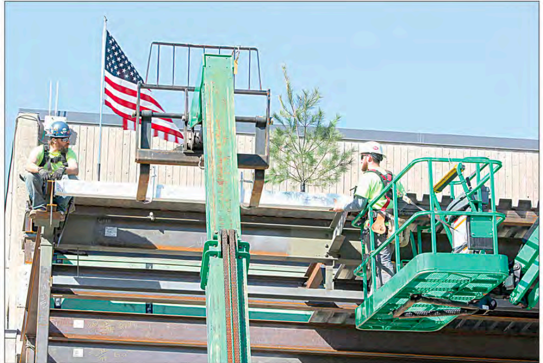
The last beam is set into place at the Holyoke Community College Campus Center.

Akin to a barn raising, "topping off" ceremonies are traditionally held as the last beam is raised into place on new buildings. Besides being painted white, the evergreen tree and American flag are common traditions.