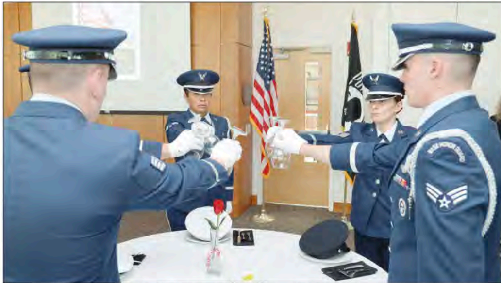
Uniformed members of Westover Air Reserve Base raise a toast to the men and women who are missing in action or have died during service.